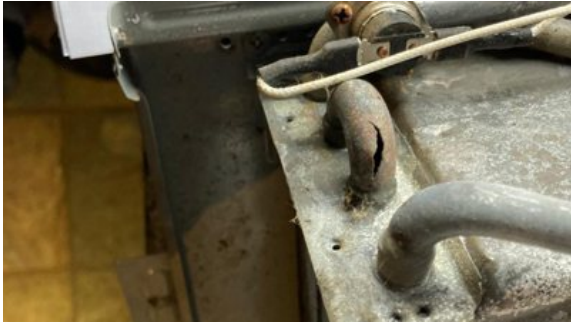
Freezing temperatures caused copper pipework in horse shower units which had not been fully drained to suffer from cracks and bursts

Sylmasta and Showerking team up to provide a repair method for portable horse shower units with burst copper pipes caused by freezing temperatures