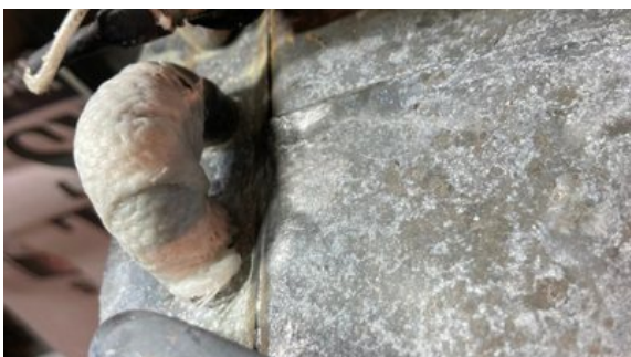
SylWrap HD Bandage forced the putty into the crack, creating a watertight seal and offering protection from future expansion of the pipe

Before the putty had fully hardened, a SylWrap HD Pipe Repair Bandage was wrapped over the entire leak area, forcing the putty into the crack for a permanent watertight seal.