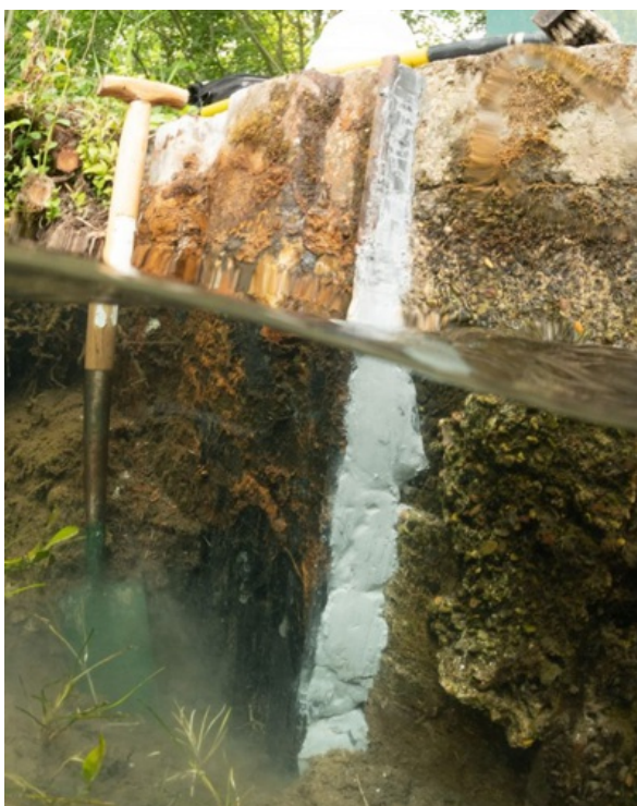
AB Original was pushed into the crack, sealing along its entire length above and below the waterline

The EA were pleased to have found a versatile material for making underwater repairs. They have since begun using AB Original in other applications.