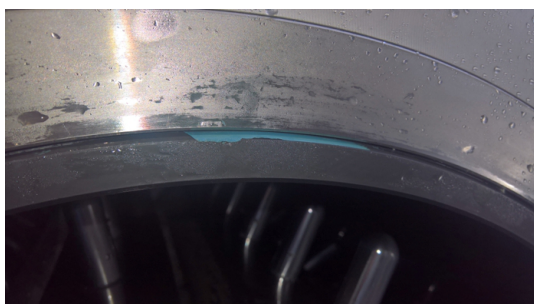
The completed repair with the outer ring fitted back onto the machine