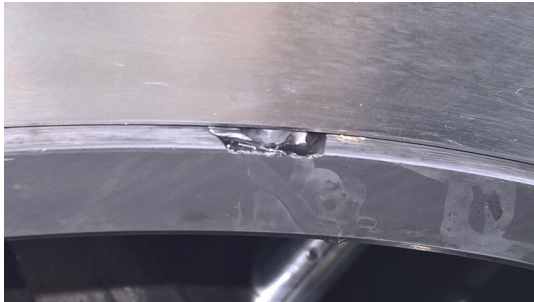
Significant crack in the machine part caused when maintenance work was carried out

A three week lead time replacing damaged metal machinery at a Ball Mill in Puerto Rico looked set to cost a company $60 million in lost revenue – until Sylmasta Ceramic Supergrade carried out a repair in under 24 hours