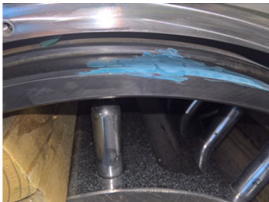
Epoxy paste during the curing process